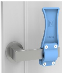
Hands Free Door Opener - Arm