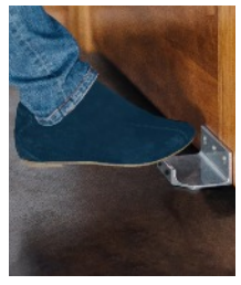
Hands Free Door Opener - Foot